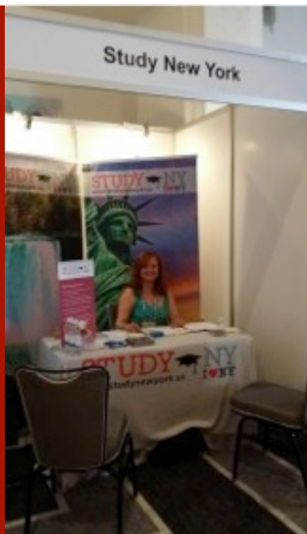
Study New York exhibiting at the ICEF North American Workshop in Miami, Florida, December 2014